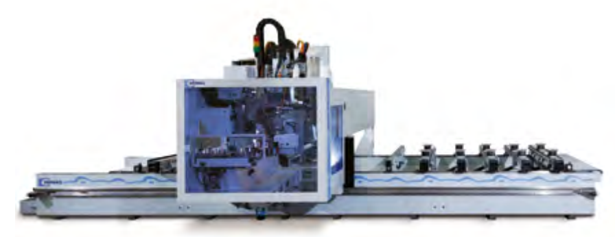
Machine bed of Nanodur® concrete - HOMAG Sorb Tech®

This bulletin contains general information only. It cannot consider chemical and/or physical influences of substances unknown to us having any contact with our products at mixing or in any other way at work on the construction site. Hence the information is perhaps not suitable for the actual application. In this case individual tests considering the actual on-site conditions are necessary. The information in this bulletin cannot be seen as a quality guarantee.