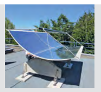
Parabolic reflector, TU Kaiserslautern