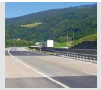
Bridge strengthening, TU Graz